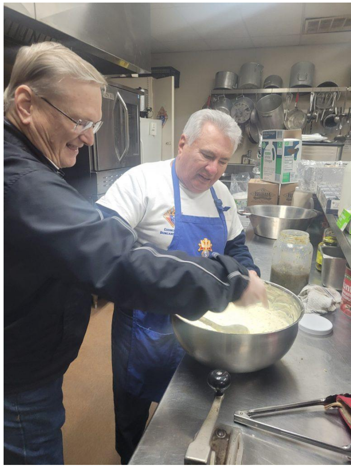
Visit our website (<u>www.kofc8157.org</u>) for more stories and pictures.