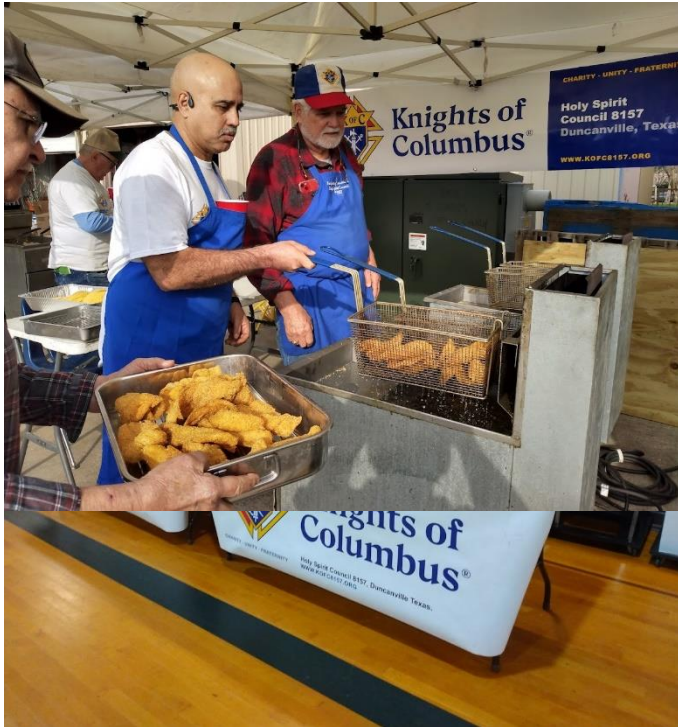
Holy Spirit Catholic Church – Duncanville, Tx,